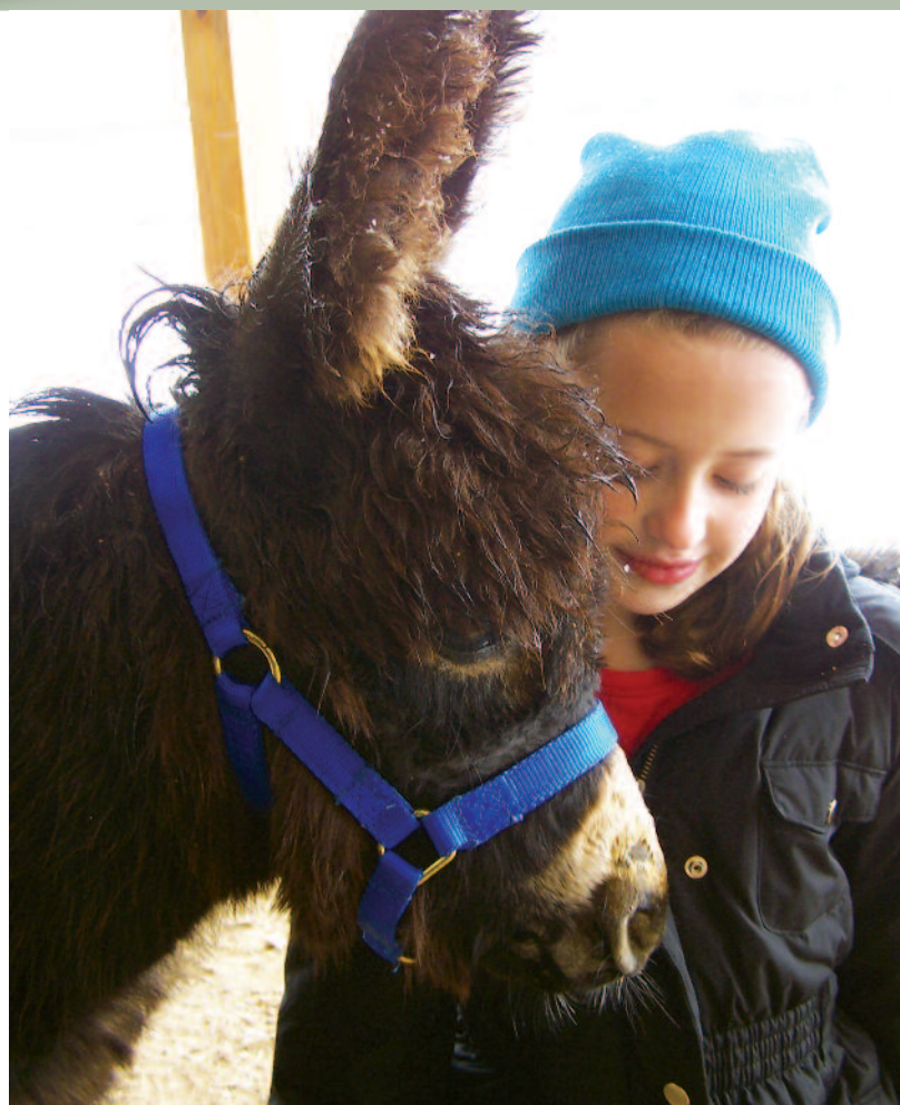
Strides to Success