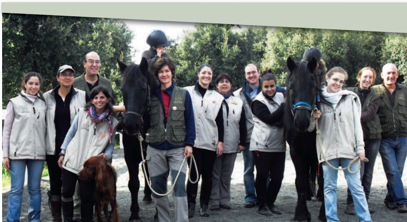
Fundacio Teràpia A Cavall

To improve the certification process and resubmission process, staff has implemented an online submission process. Along with dedicated PATH Intl. volunteer certification committee members, the staff has worked hard to promote the professionalism of workshops and certifications and increase their numbers; institute quality control; uphold safety standards; and offer members a positive experience.