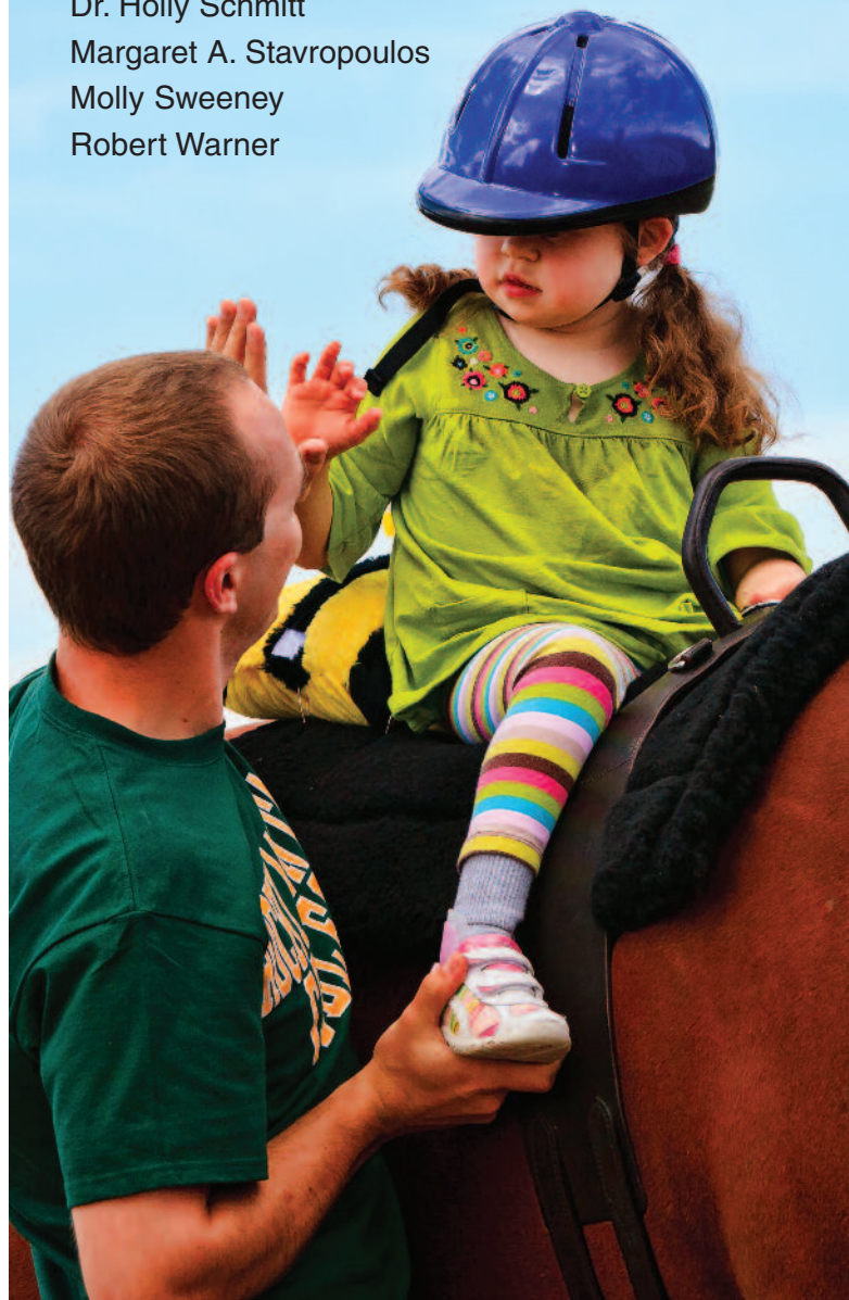
Rocky Mountain College