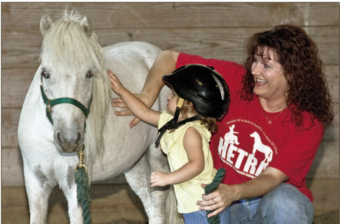
Heartland Equine Therapeutic Riding Academy

The NARHA Administration will oversee a fund development plan to create new funding sources and capitalize on existing ones. NARHA will continue to build and oversee alliances with key organizations that share the organization's vision and support its mission.