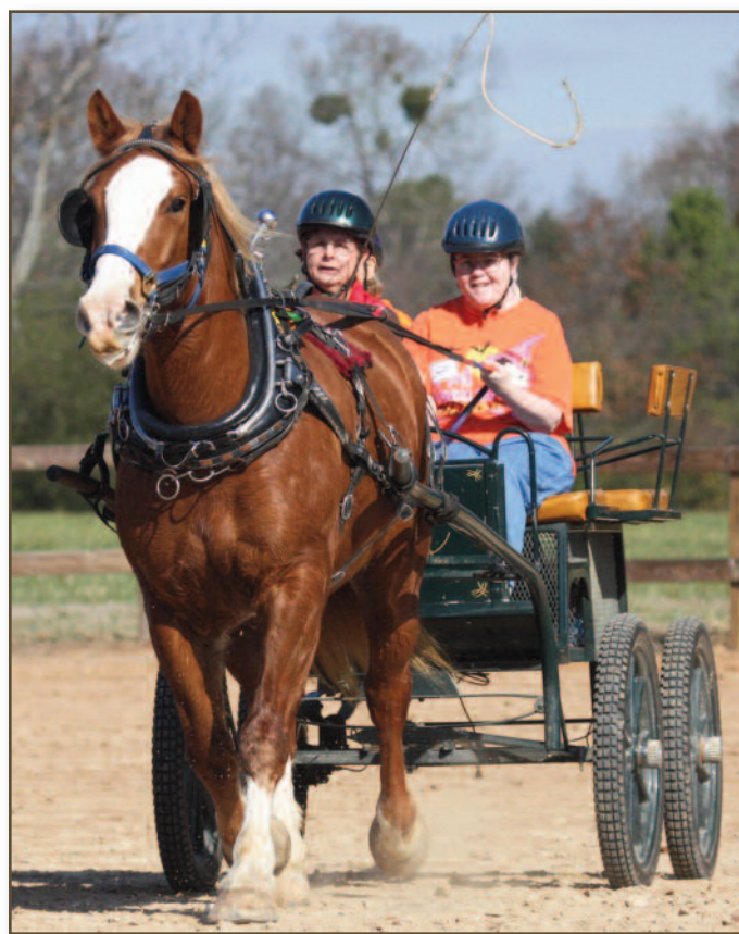
Driving Magic, Inc.