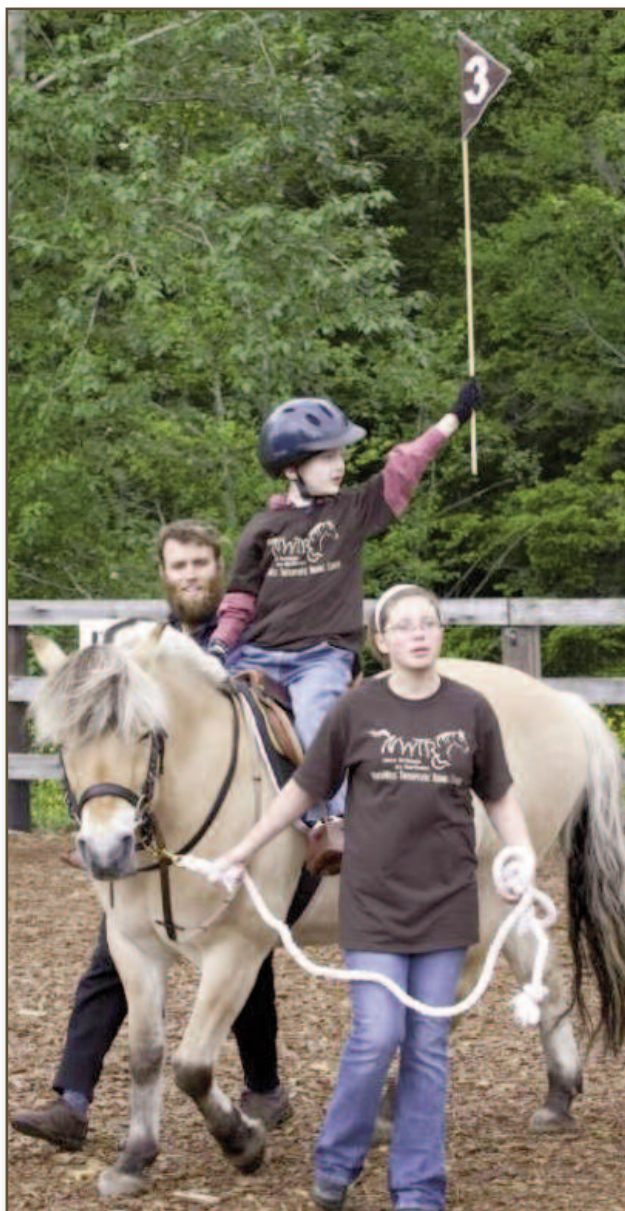
Northwest Therapeutic Riding Center

In 2009-2010, NARHA accredited 37 centers—27 centers reaccredited and 10 centers became newly accredited as NARHA Premier Accredited Centers. A lead and associate site visitor traveled to each of these 37 centers during 2009–2010.