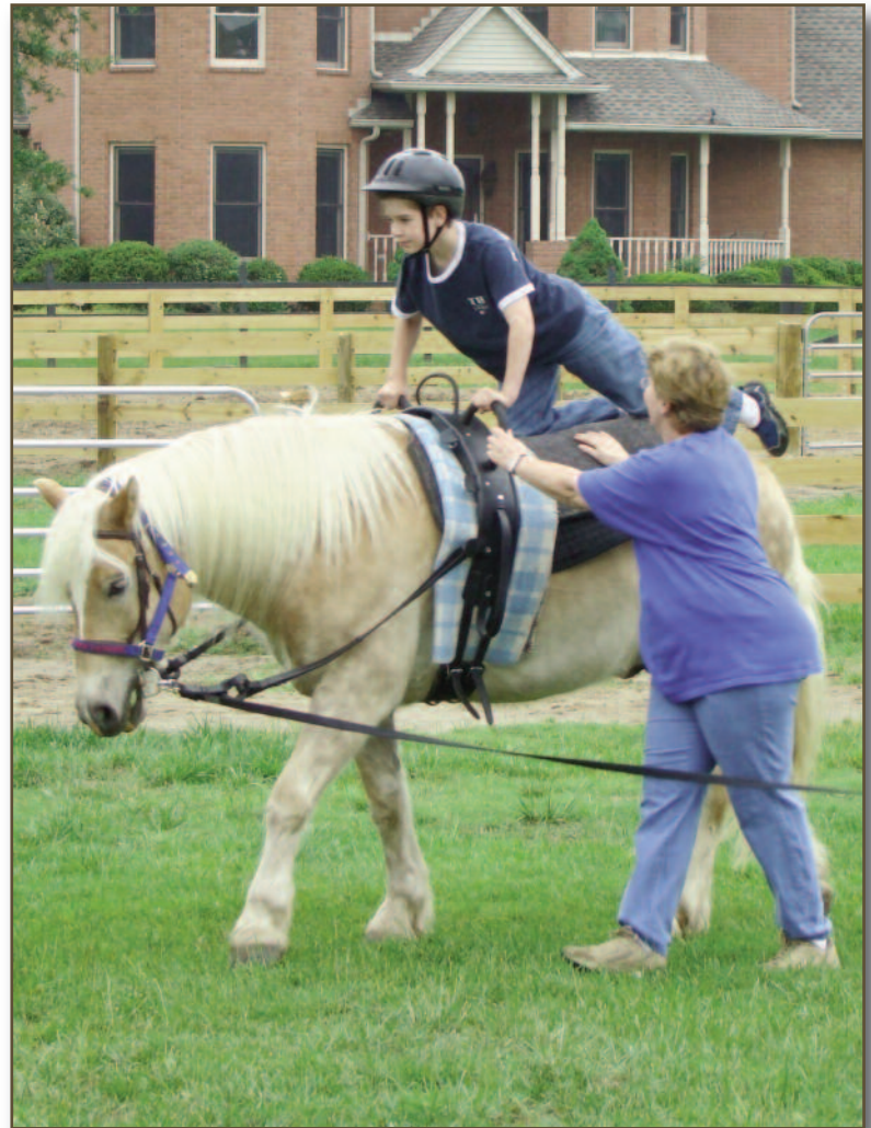
Therapeutic Animal Partners

Three equine specialist workshops were held in 2009-2010. In addition, the Equine Specialist Certification Subcommittee finalized its approval for an equine specialist certification; the proposal was supported by Certification Oversight Committee and has since been recommended by Programs & Standards Oversight Committee and approved by the NARHA Board of Trustees. Faculty training and pilot certifications to sort out logistics are the remaining tasks to complete before launch.