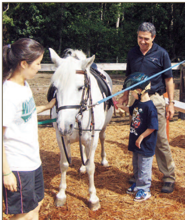
Northwest Therapeutic Riding Center

Grants and major donations were received from these organizations: American Association of Equine Practitioners, American Paint Horse Foundation, American Quarter Horse