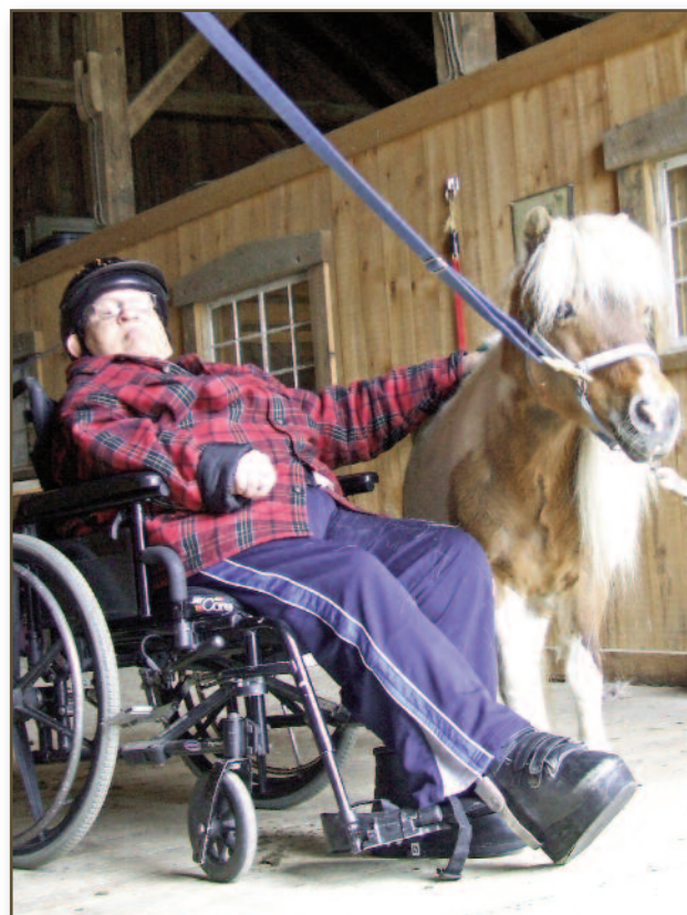
Equest Therapeutic Riding Center