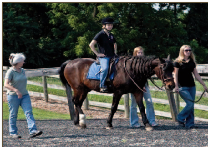
Rose of Sharon Equestrian School

We have made a sincere effort to accurately honor each and every contributor in this publication. The following contributions were made between July 1, 2009 and June 30, 2010. If you notice an error, please accept our apology and notify byost@narha.org so that we may correct the error and our records.