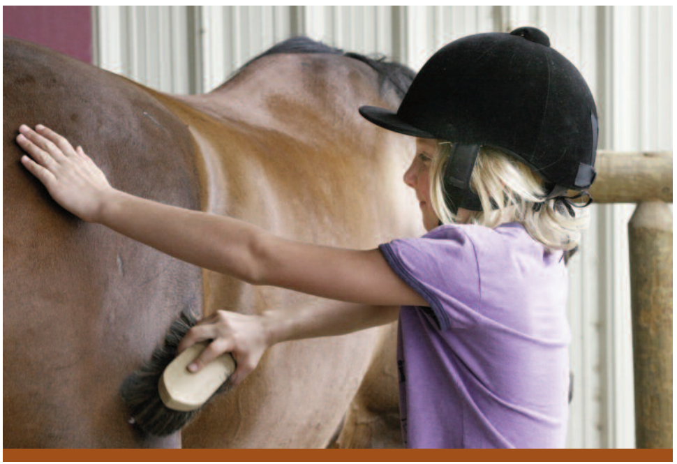
colorado Therapeutic Riding Center, Inc.