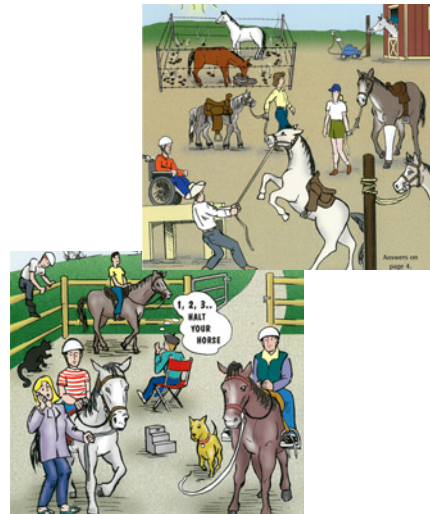
These artist renderings show a wide array of PATH Intl. standards violations that would make a photo noncompliant and unusable by the association.

Photographic images help PATH Intl. convey its unique brand personality and more specifically the equine-assisted activities and therapies profession. PATH Intl. uses photographic images in print or electronically that comply with PATH Intl. standards.