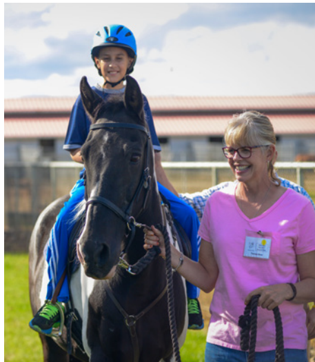
Rider wearing helmet and it is properly fitted, safety stirrup in use, lead rope not wrapped around horse leader's hand, etc.