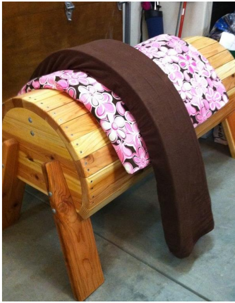
Pad and Foamie