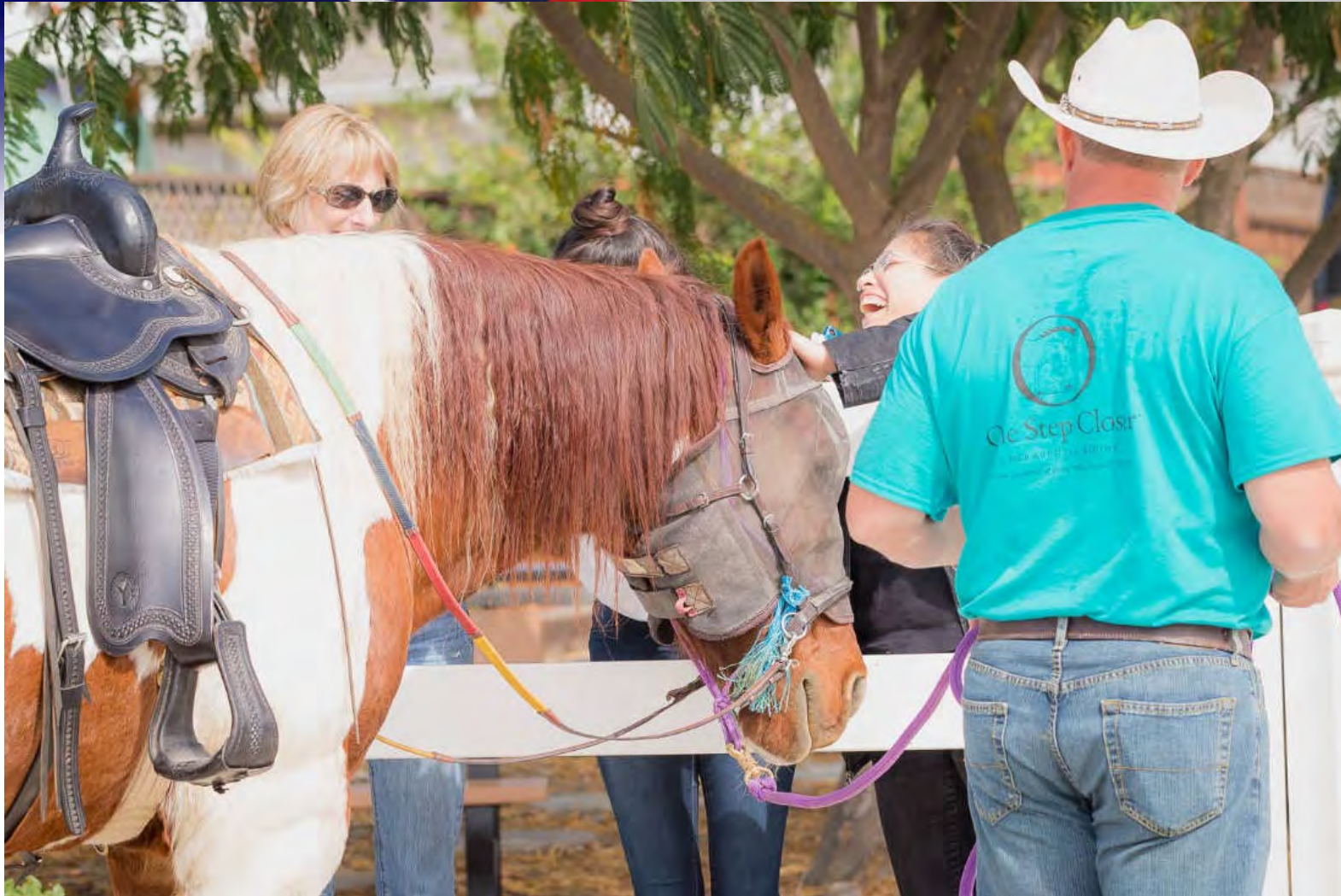
One of our Veteran Volunteers with equine Chief