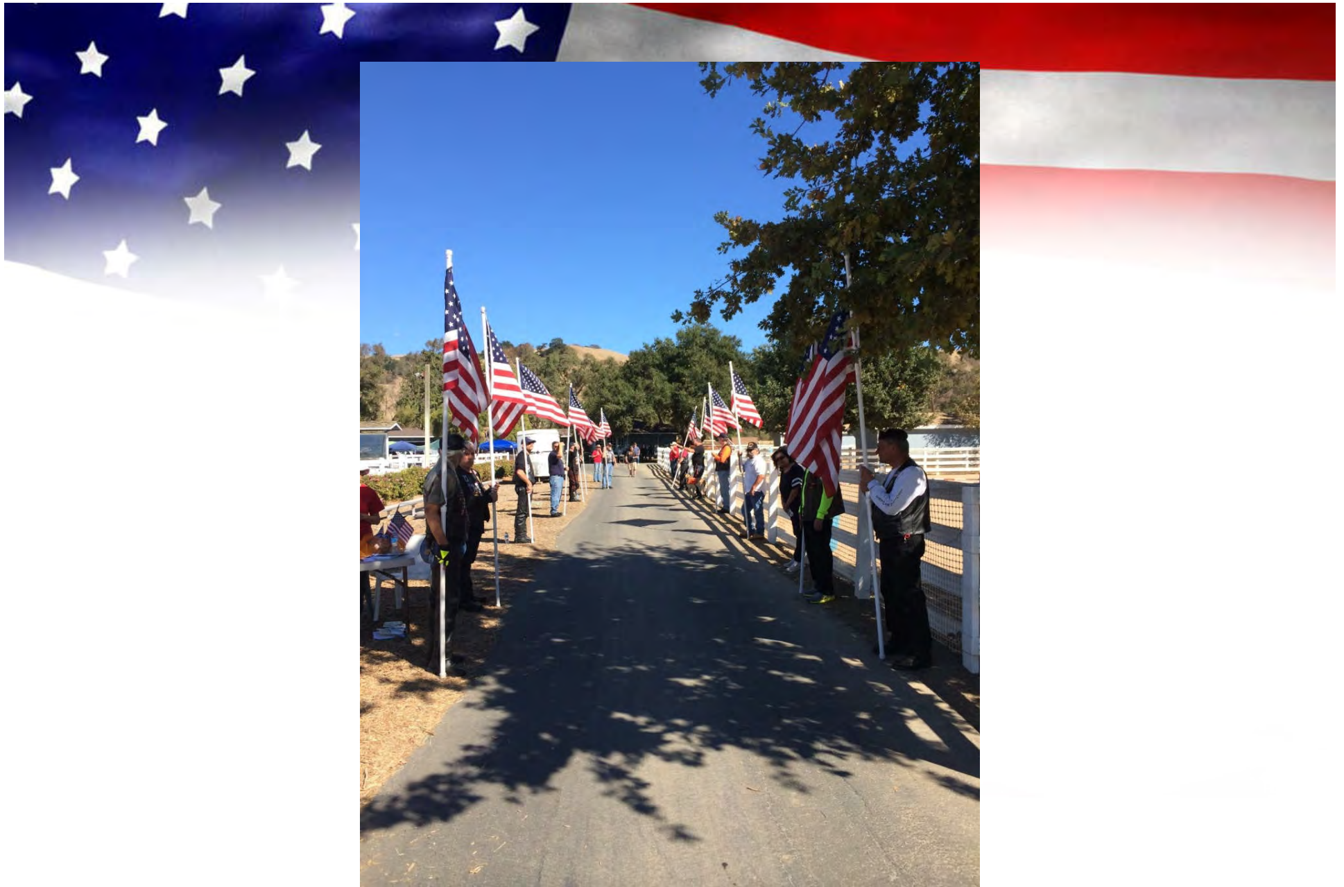
Honor Flag Line