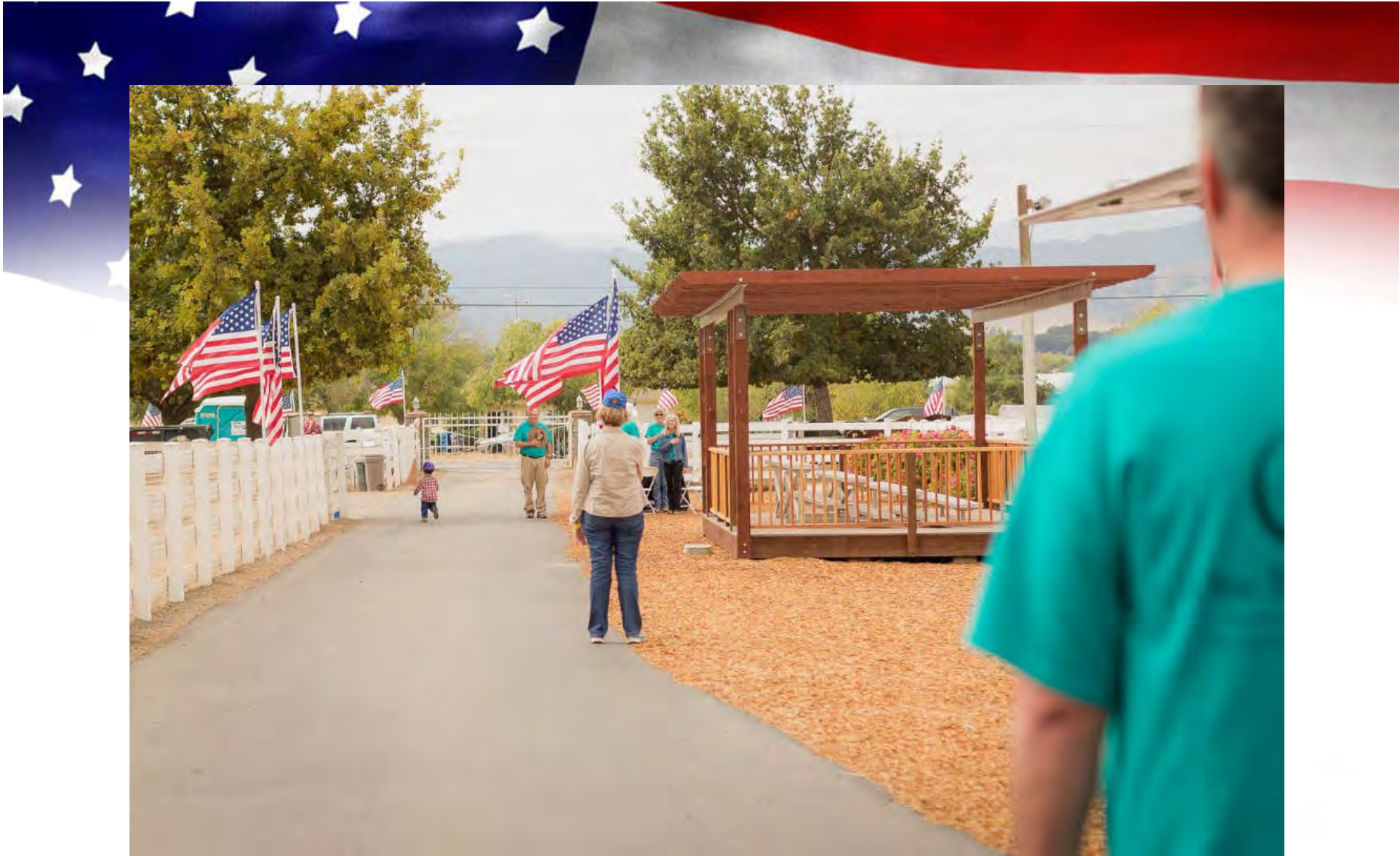
OSC tradition: National Anthem and Opening Prayer