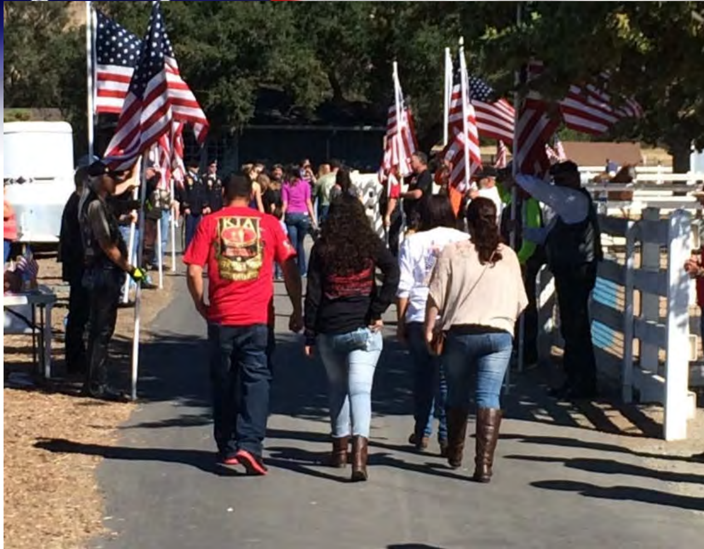
Guests of Honor