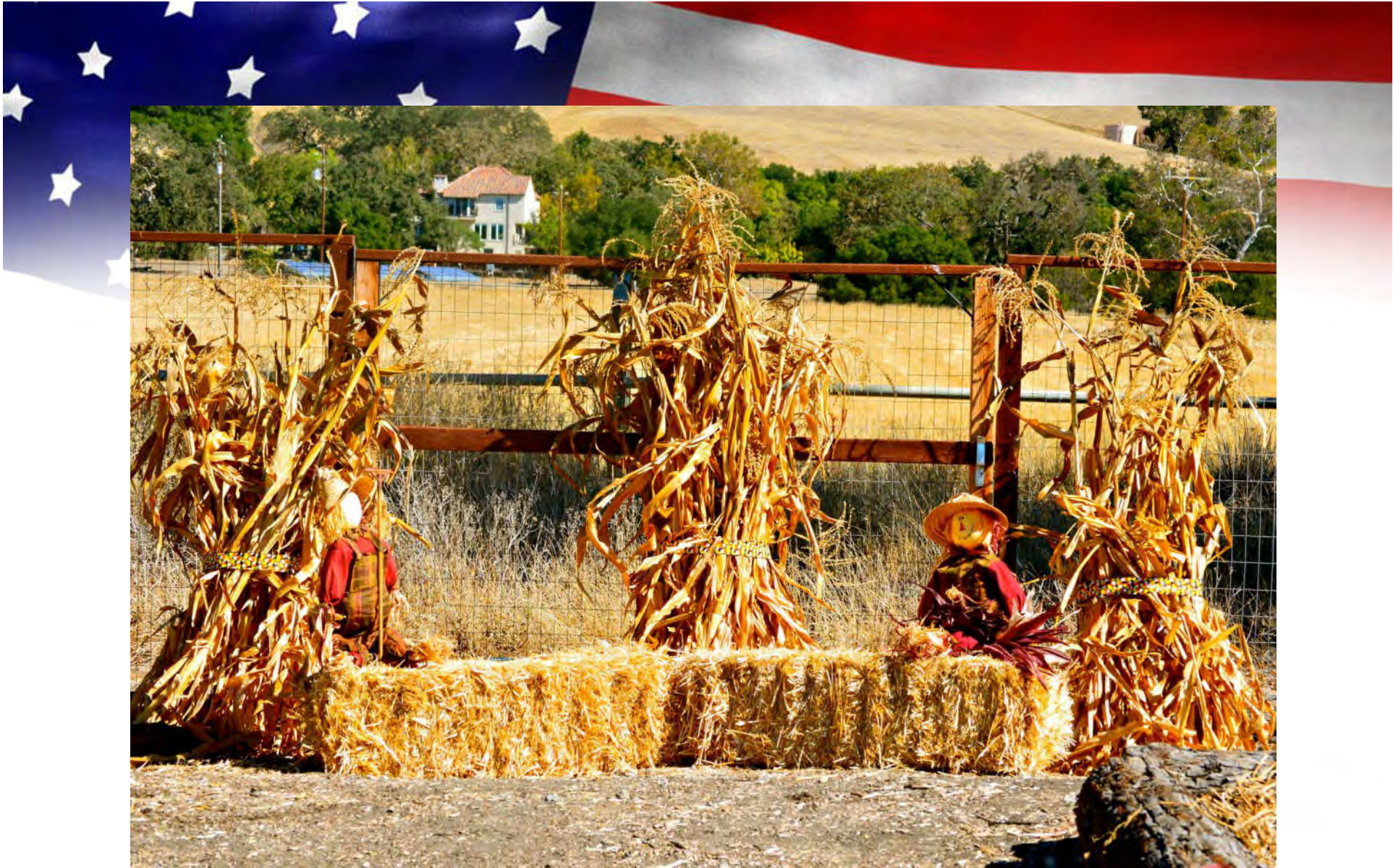
Group Photo Setting