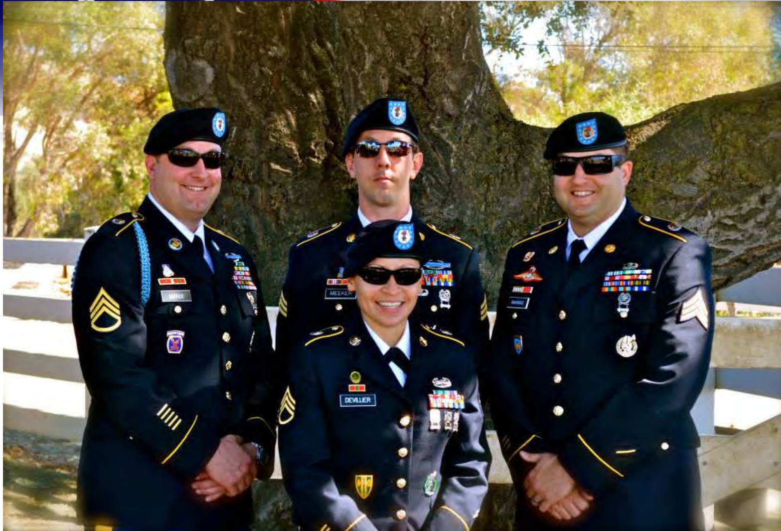
U.S. Army Honor Guard