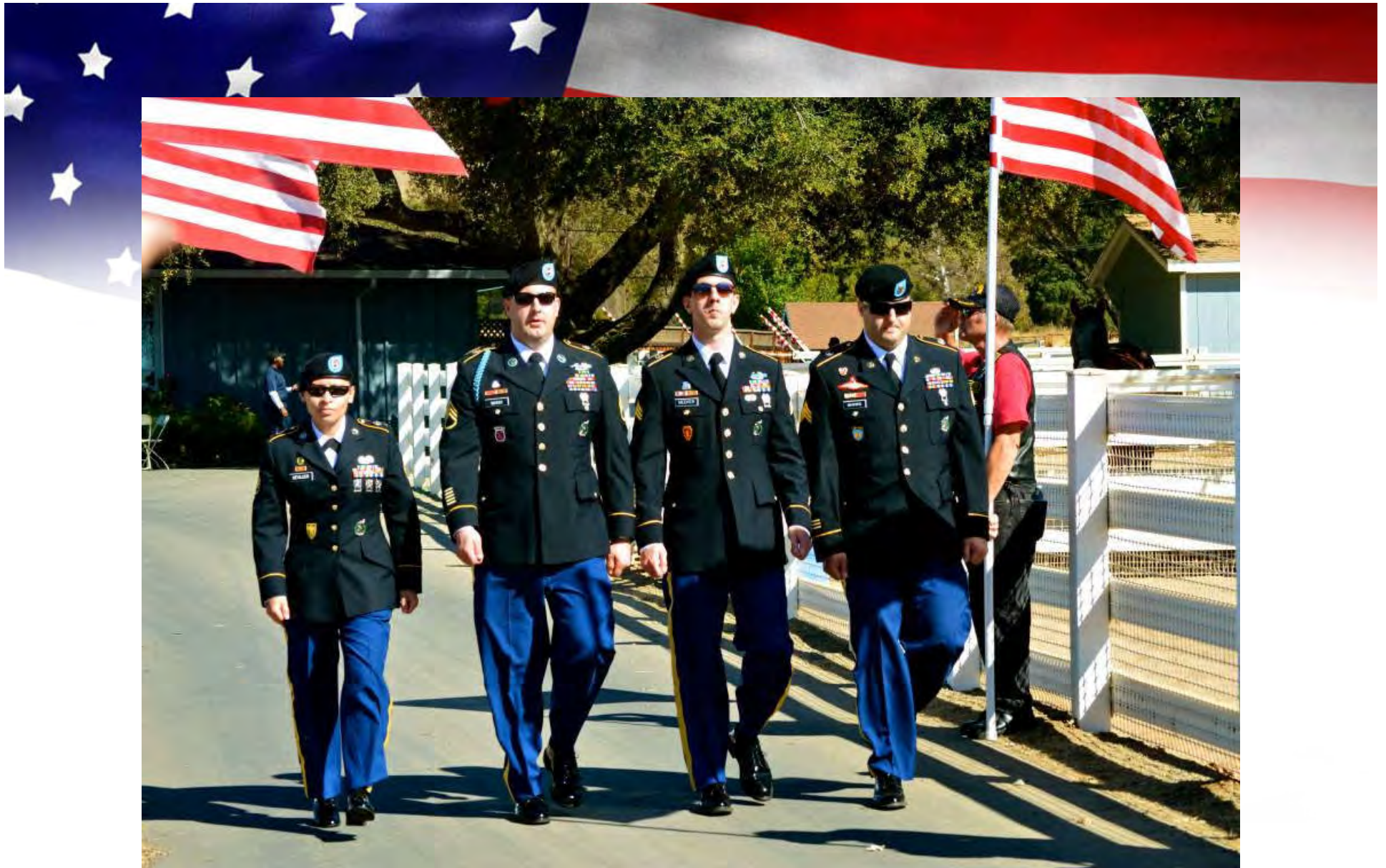
Formal escort by U.S. Army