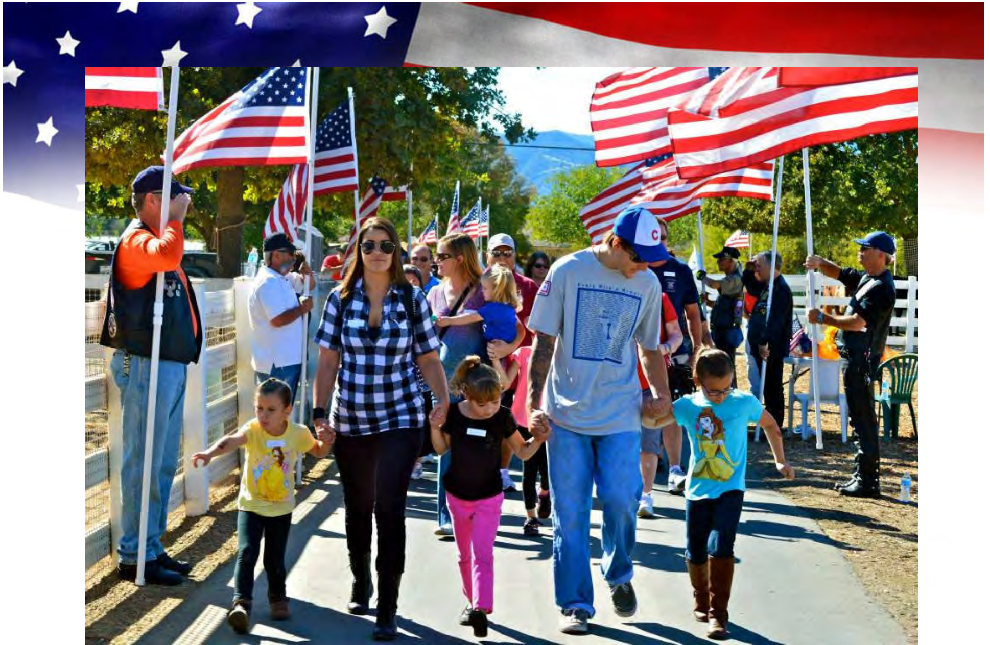
Guests of Honor