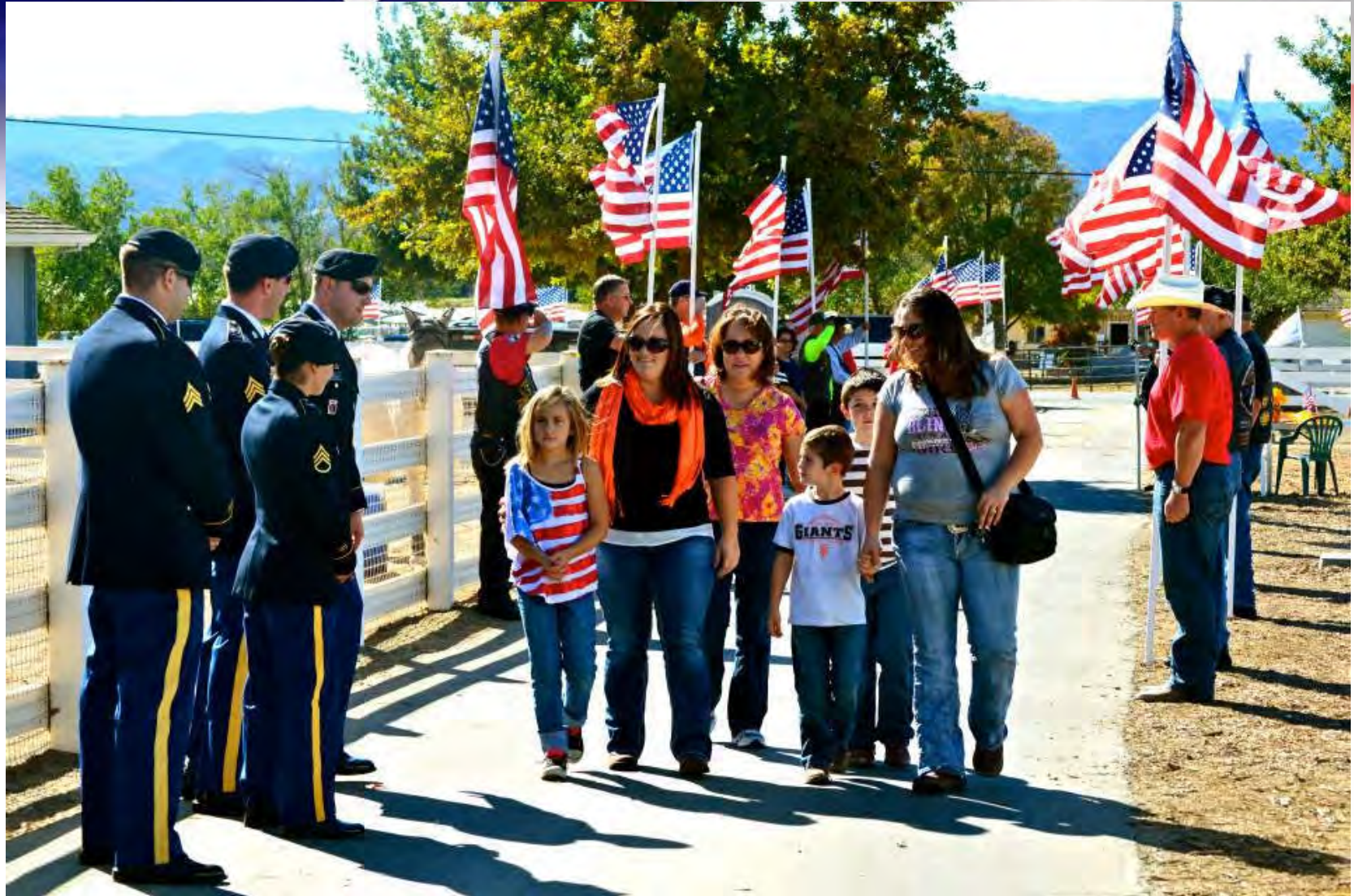
Guests of Honor