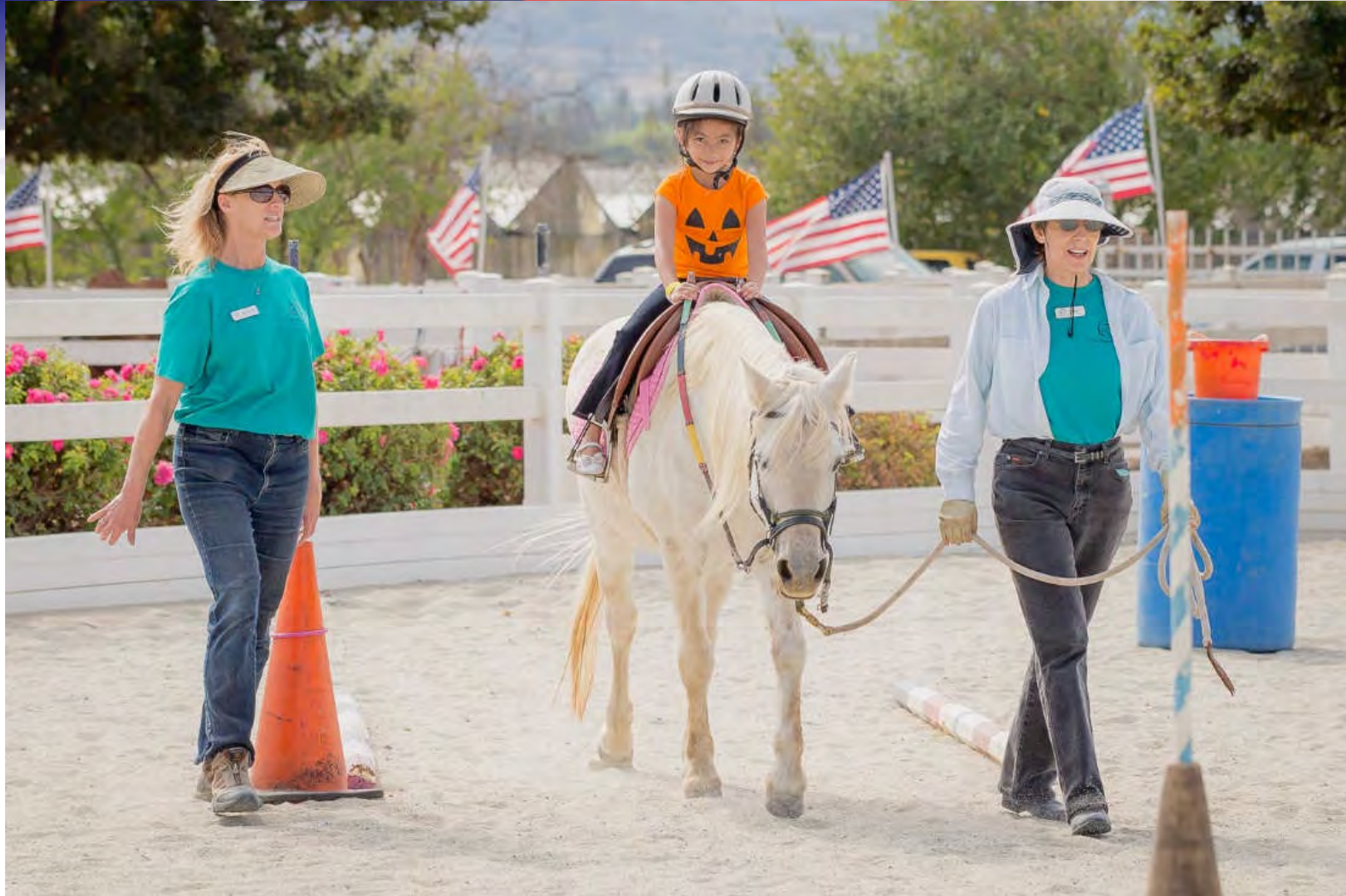
Children riding with OSC regular volunteers assisting