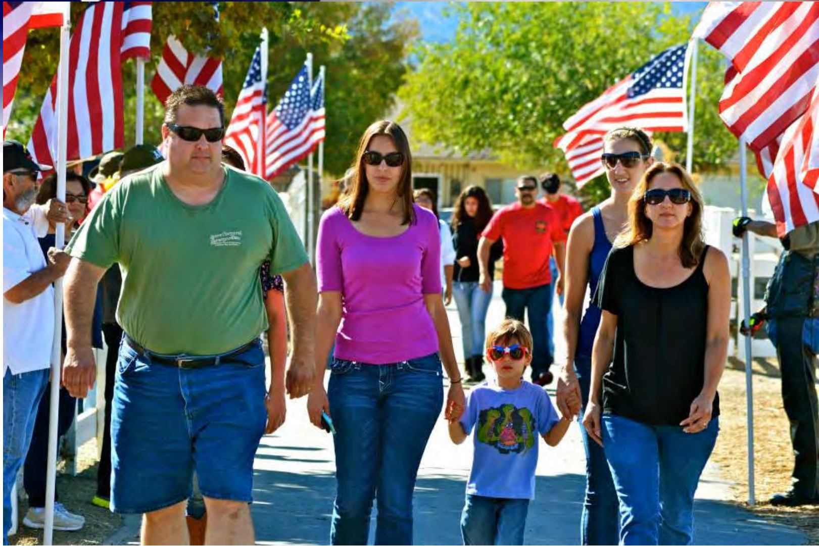
Guests of Honor