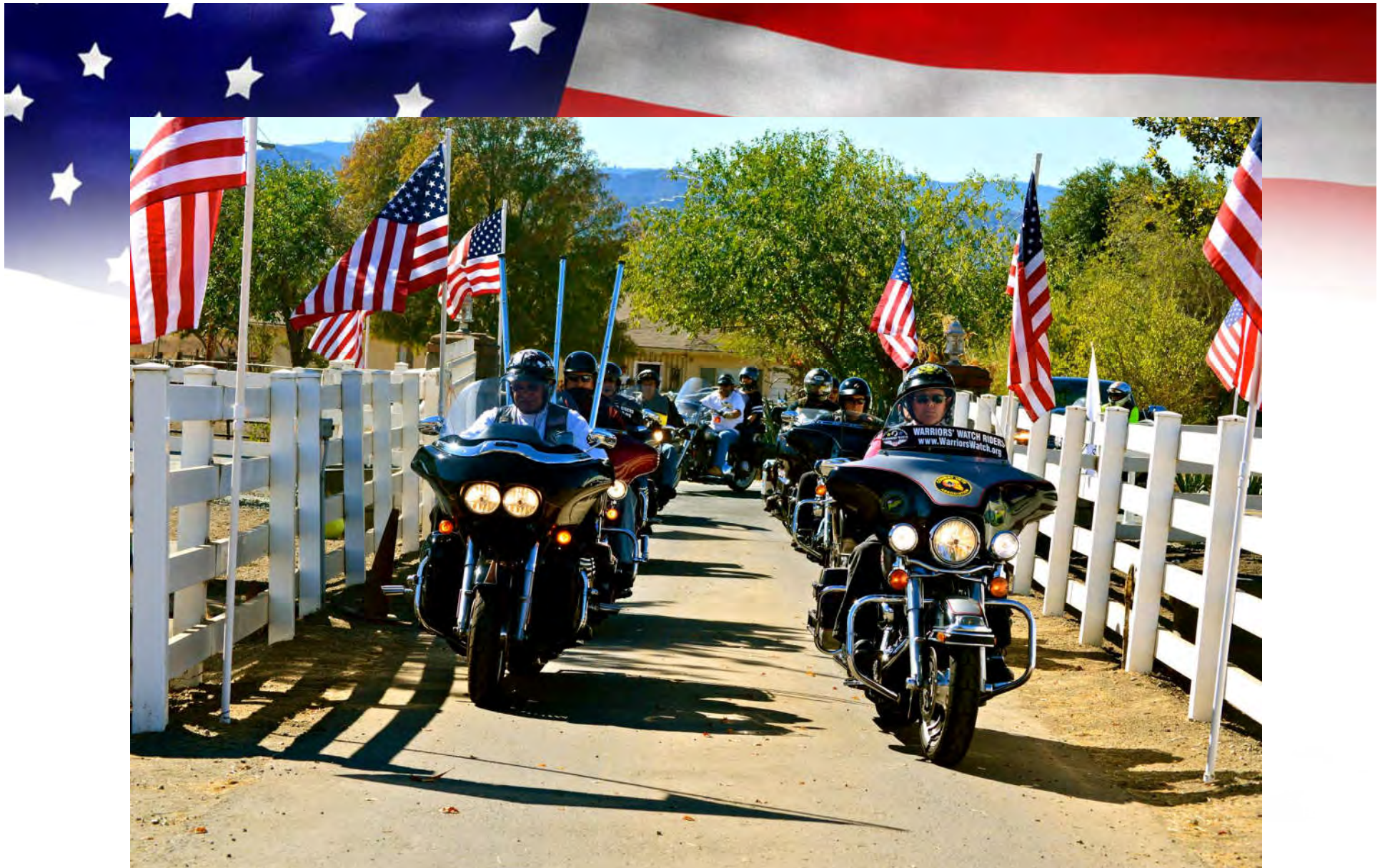
Warriors Watch Riders and Patriot Guard Riders arriving