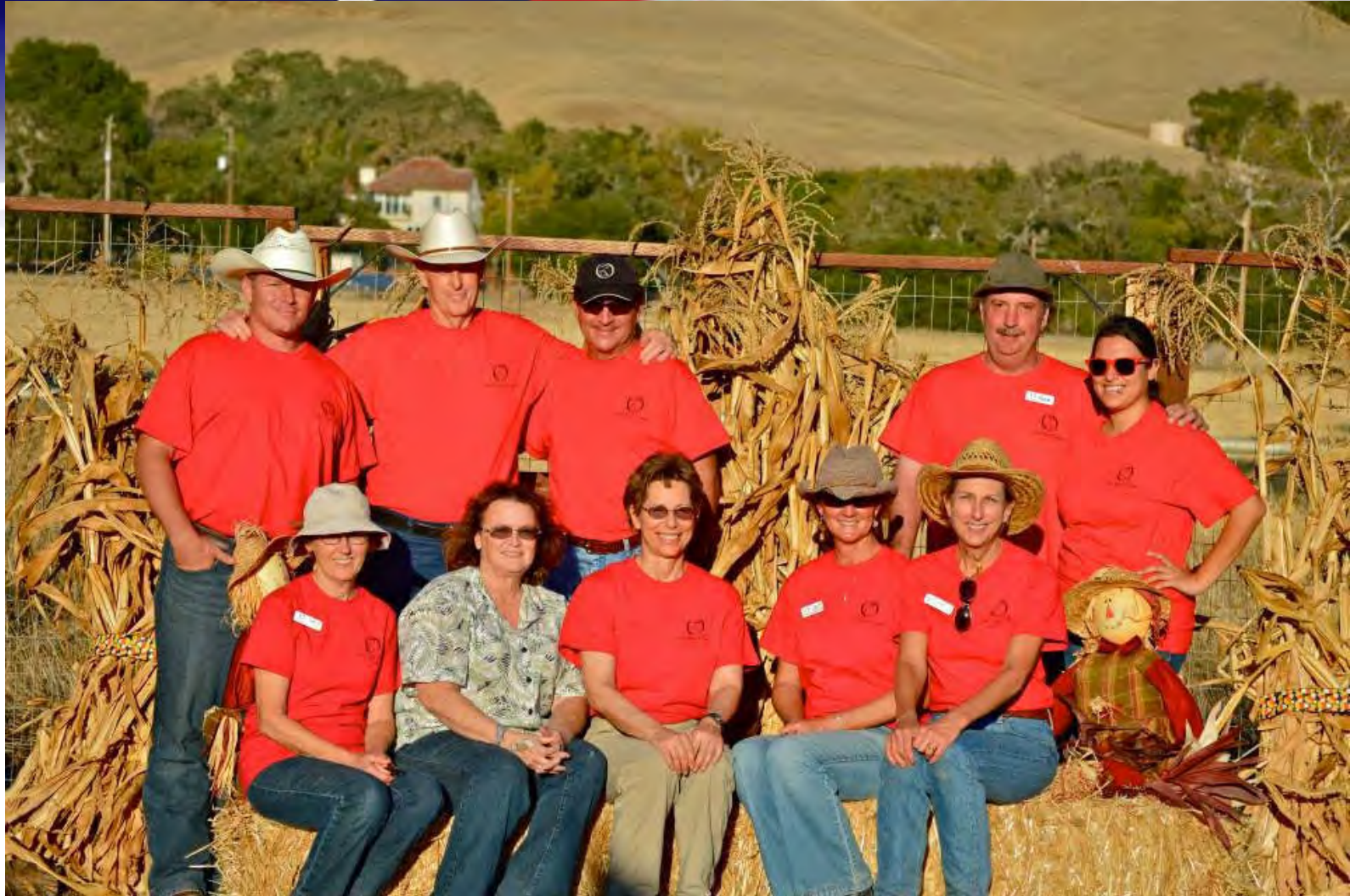
Our Team for the Day