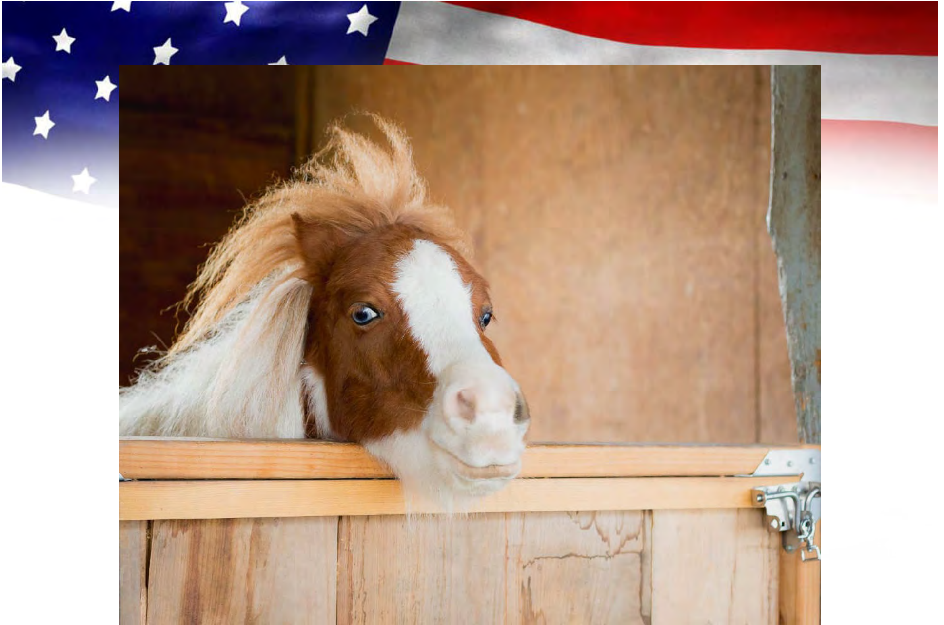
Mr. Sunshine (mini) visits with all the guests